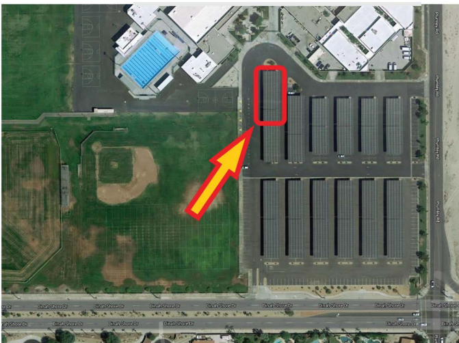
Cathedral City High School - Mondays